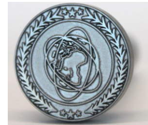
Example of a generic tactile impression die.